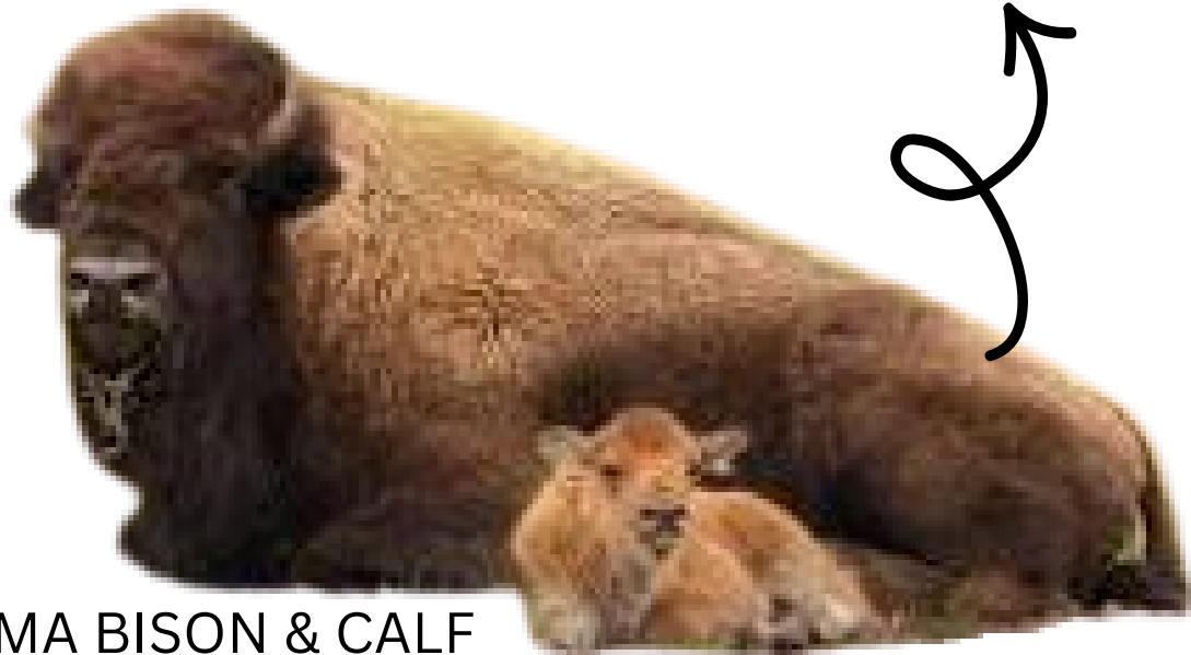
MAMA BISON & CALF

JULY 12 - SUNDAY HARLOWS RANCH BISON CO EVENT THOMPSON FALLS MT